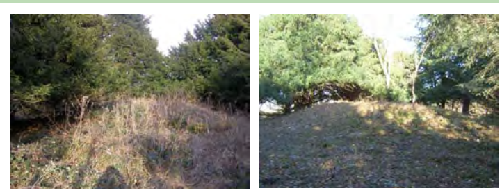
Bowl Barrow at Graffham Down - Before and after clearance

On the SDW corridor between Cocking and Upwaltham there is a wealth of archaeological features. In order to maintain their prominence within the landscape, it is essential to keep them clear of excessive vegetation. Western Area officers and volunteers have cleared the growing summer vegetation from three bowl barrows and three cross-dykes, all of which are Scheduled Ancient Monuments.