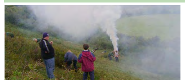
Lloyds Bank employees and Volunteer Rangers work together at Mill Hill Local Nature Reserve, near Shoreham