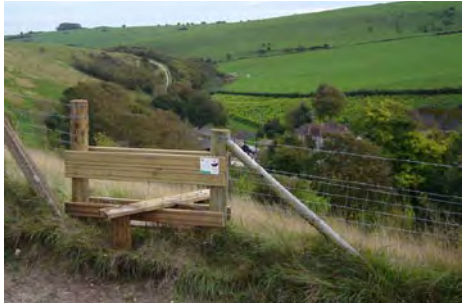
Open access at Breaky Bottom

As part of the project to tackle illegal use of Rights of Way by vehicles, Area staff have set up vehicle monitoring equipment on Southwick Hill, this equipment detects