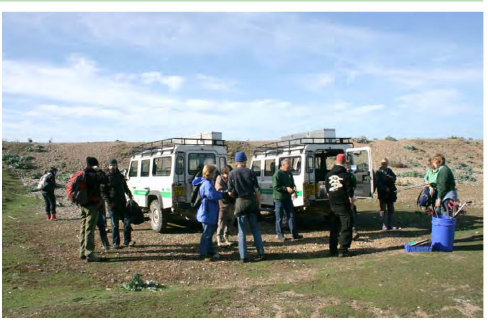
Volunteers preparing to undertake a beach clean at Cuckmere Haven

of the elms over many years. We look forward to receiving her reports of diseased elms in the future.