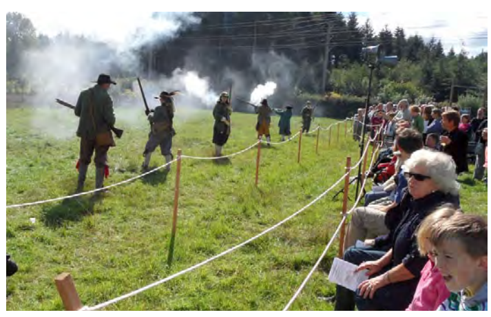
Fernhurst Furnace Open Days Event

The Northern Area team attended the Pulborough Harvest Fair in September. This event was well attended and a significant number of questions were asked about the South Downs National Park. The Area team also assisted at the Fernhurst