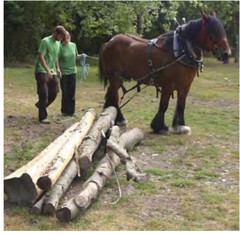
Horse logging at Hampshire Wood Fair

talks, shows, demonstrations, stalls and re-enactment groups. The event was supported and sponsored by Hampshire County Council, Forestry Commission and the South Downs Joint Committee.